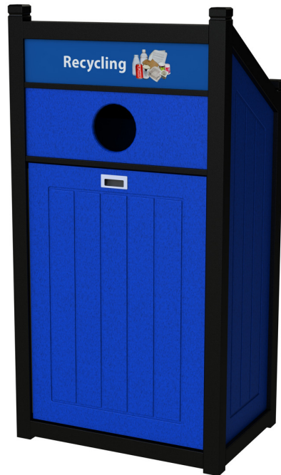
Transition® TXZ 36