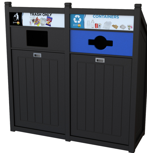
Transition® TXZ 72-2