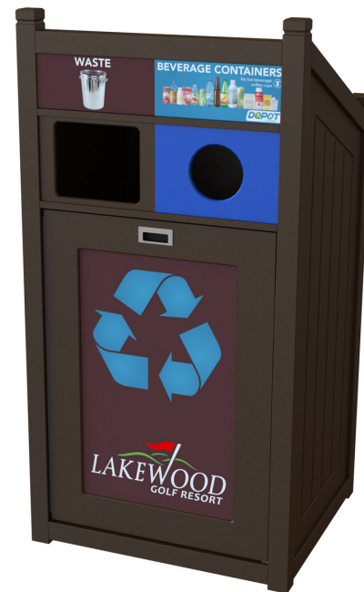
Transition® TXZ 51-2